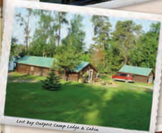
Lost Bay Outpost Camp Lodge & Cabin