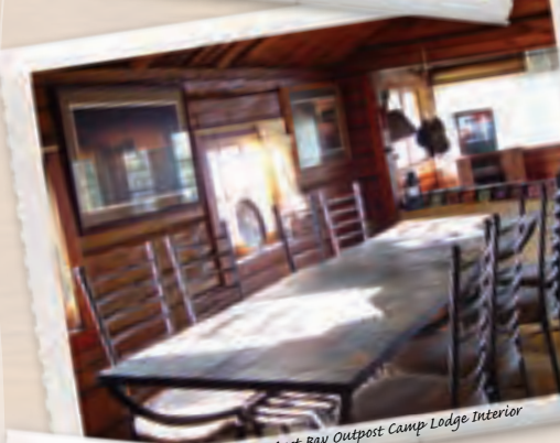
Lost Bay Outpost Camp Lodge Interior