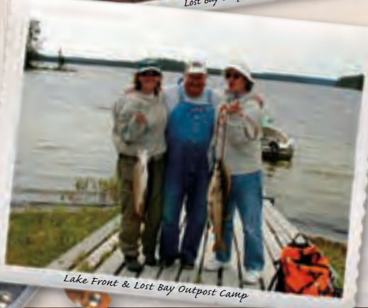
Lake Front & Lost Bay Outpost Camp