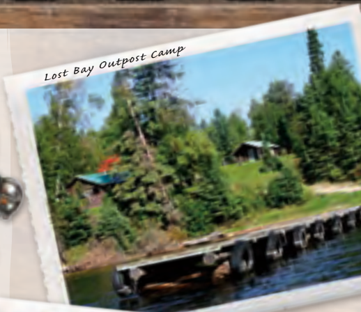
Lost Bay Outpost Camp

There are two sleeping only cabins to facilitate larger groups.